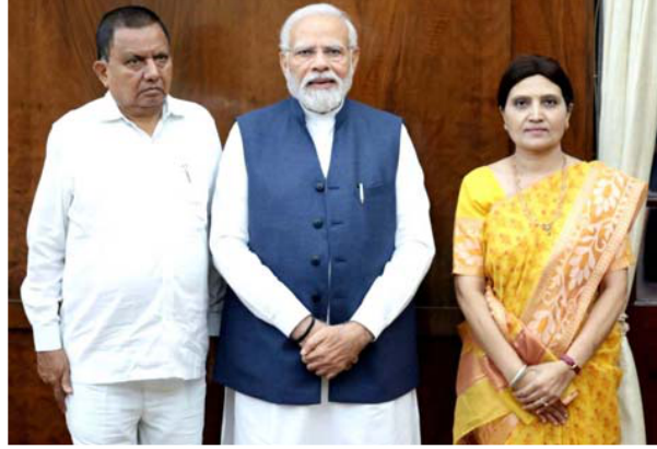
(પ્રતિનિધિ) સેલવાસ, હાલ માં દેશ ની સંસદ માં ચોમાસું સત્ર ચાલી રહેલ છે.

(પ્રતિનિધિ) સેલવાસ, હાલ માં દેશ ની સંસદ માં ચોમાસું સત્ર ચાલી રહેલ છે. વિવિધ રાષ્ટ્રીય વિવાદો પર ભારી હોહા ના કારણે સંસદમાં સામાન્ય પ્રશ્નકાળમાં પોતાના વિસ્તારો ના મુદ્દાઓ રજૂ કરવા માટે સાંસદો માટે મુશ્કેલ બની રહેલ છે. દાનહ ના પ્રથમ મહિલા સાંસદ કલાબહેન ડેલકરે દેશના પ્રધાનમંત્રી શ્રી નરેન્દ્ર મોદી ની રુબરુ મુલાકાત લીધી હતી. આ ઓપરારિક મુલાકાત દરમિયાન દાનહ સાંસદ પ્રદેશમાં કેન્દ્ર સરકાર દ્વારા ચાલી રહી વિવિધ વિકાસીય યોજનાઓ માટે આભાર વ્યક્ત કર્યો હતો.